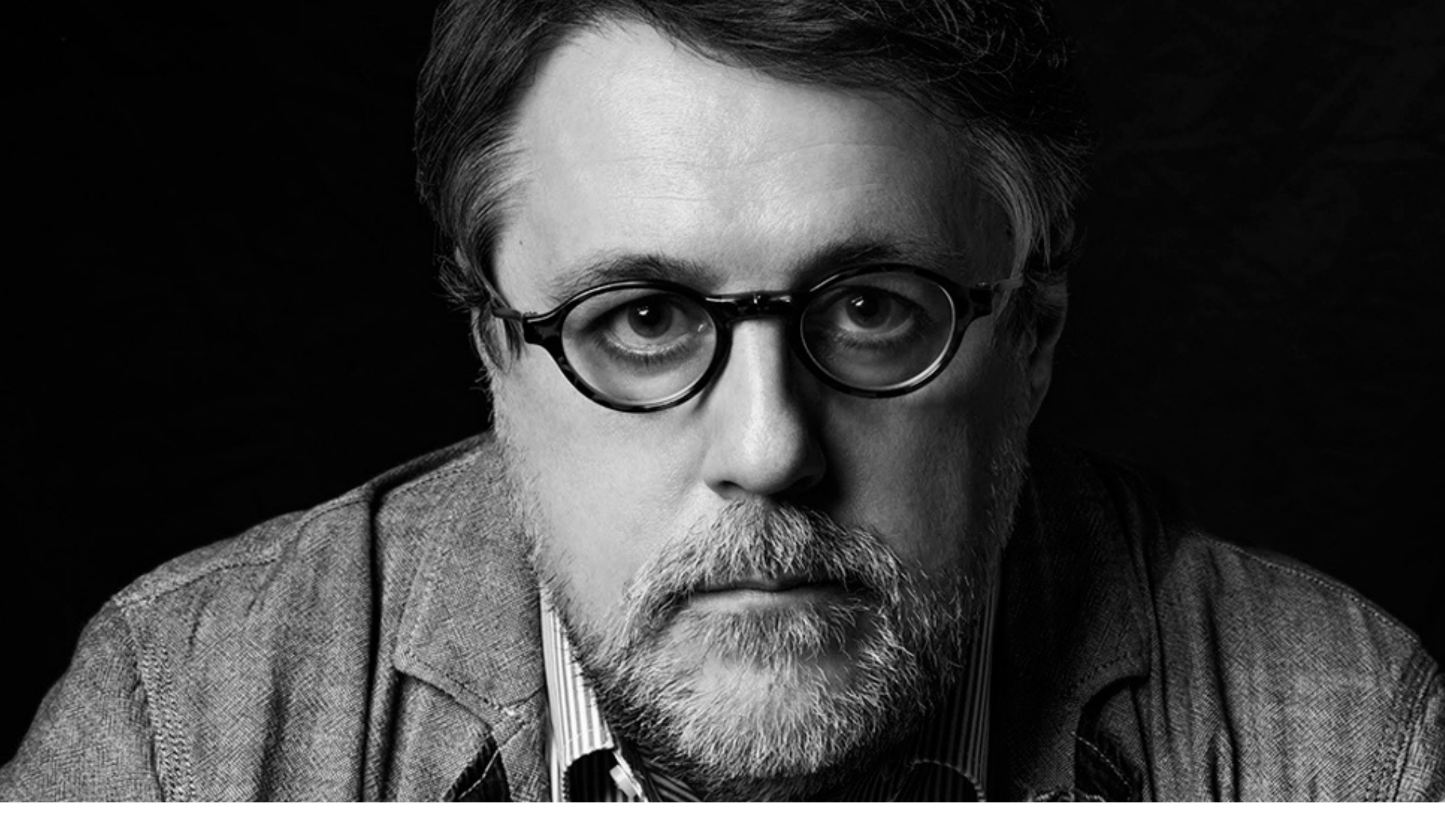
Founder and President of ArtDocFest